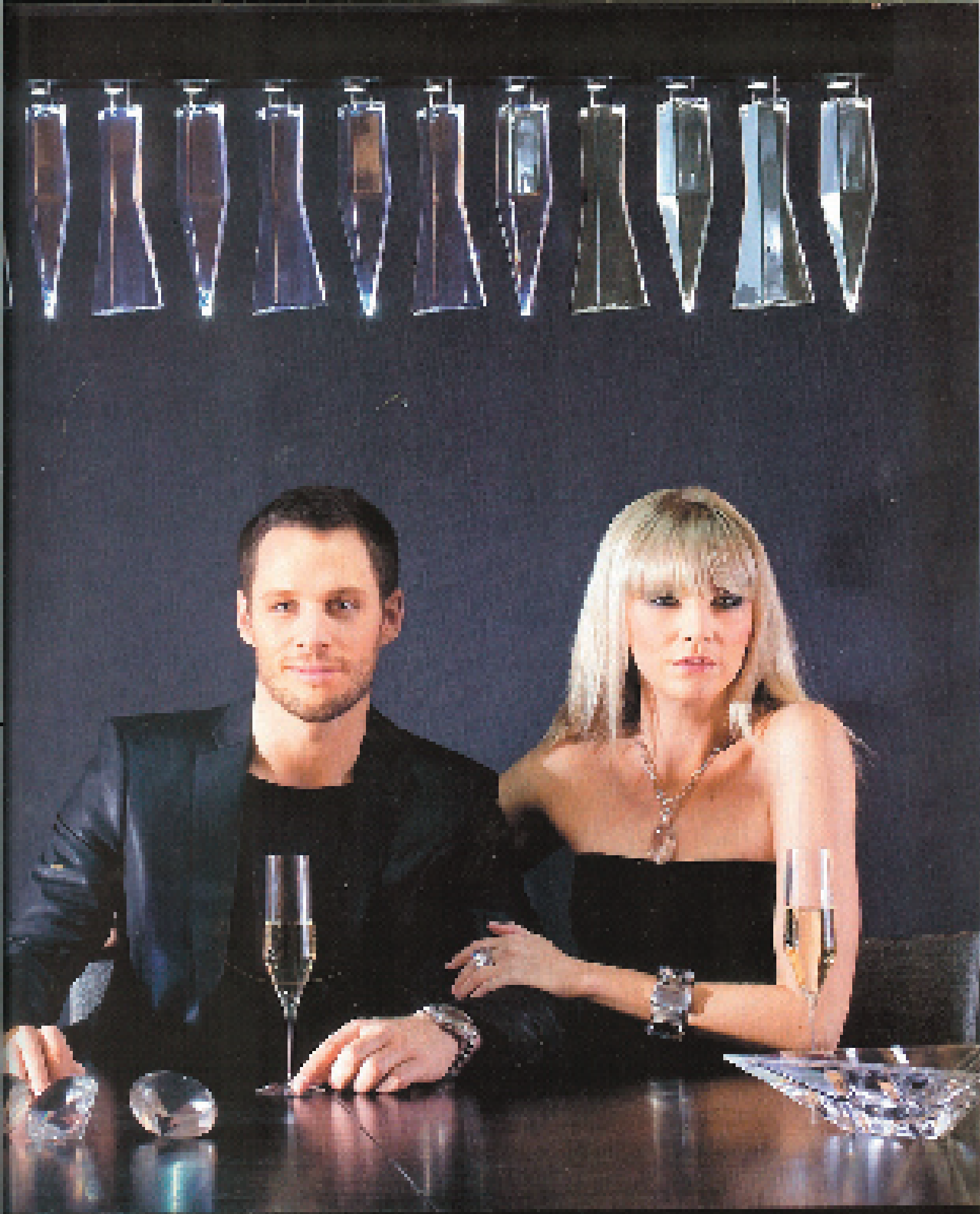
Man: suit by J. Gaultier, shirt by J. Gaultier, watch by J. Gaultier, ring by J. Gaultier, necklace by J. Gaultier, bracelet by J. Gaultier, earrings by J. Gaultier, shoes by J. Gaultier. Woman: dress by J. Gaultier, necklace by J. Gaultier, watch by J. Gaultier, ring by J. Gaultier, earrings by J. Gaultier, shoes by J. Gaultier.